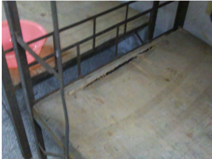
Bed board, splitting

The dormitory rules state that workers can only air out their quilts and