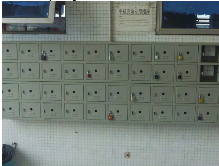
Phone Charging Area