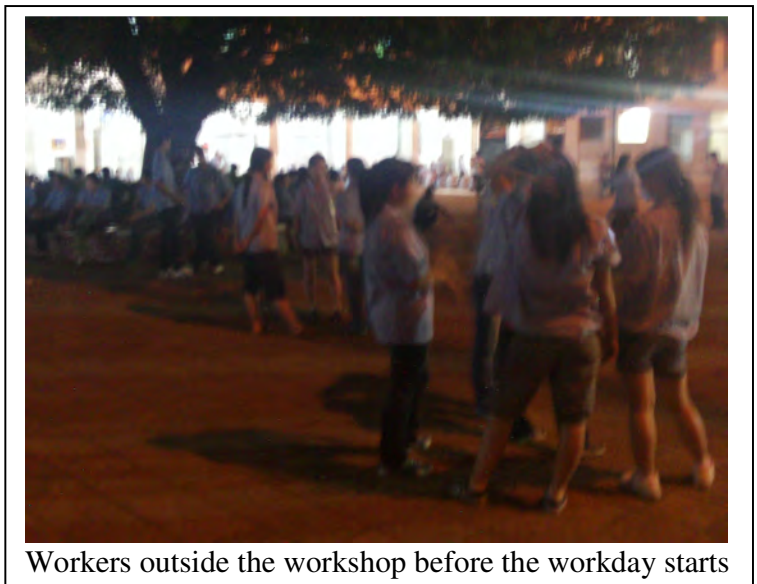
Workers outside the workshop before the workday starts

The labor contract is signed 3 months after hiring. The contract is for 3 years, with a 3 month probationary period. There are two copies of the labor contract, and both the factory and the worker get a copy. There are, however, exceptional cases; one worker, who had worked at the factory for four months, signed two copies of the contract and the factory retained both.