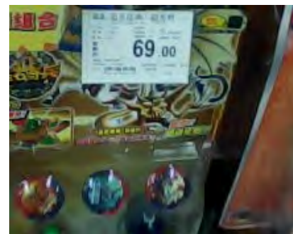
Pic 2 Toy manufactured by Lanyu on sale in a Carrefour store.

Based on our recent investigations, we are more assured that Lanyu is one of Carrefour's suppliers. Employees of CLW have visited one of Carrefour's stores in Bao'an District, Shenzhen City twice, one in January 2010 and the other one on June 12, 2010. Products of Lanyu were found being sale. (See Pic 1 and 2 above) One toy