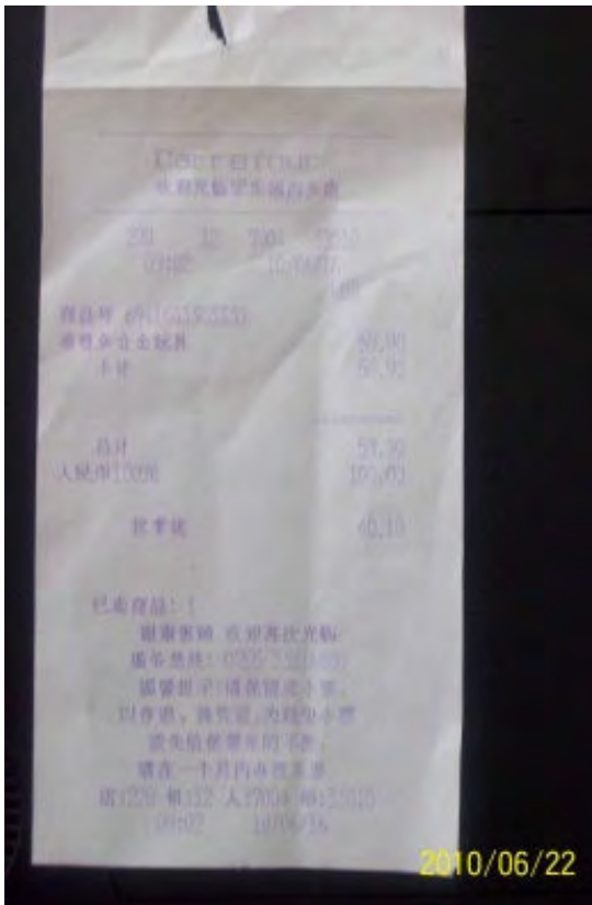
Pic 5 Receipt indicates the toy is purchased from Carrefour store.

Based on the facts above, we are not satisfied with the response of Carrefour. China Labor Watch suggests Carrefour improve the management of its supply chain, control comprehensive information on its suppliers, and take action to improve the working and living conditions of its labor workers to fulfill its social responsibility.