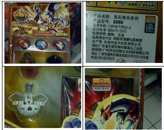
Pic 4 Logos and labels clearly indicate the toy is manufactured by Lanyu.