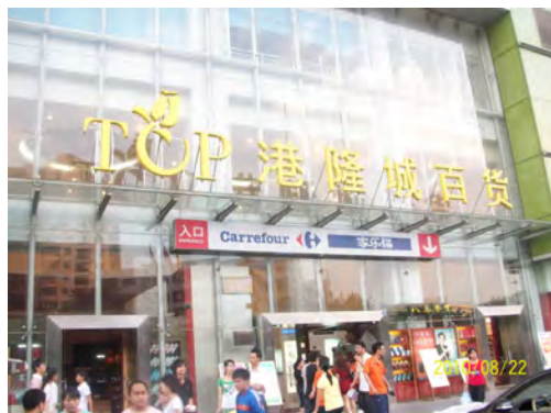
Pic 1 External view of the Carrefour store investigated

China Labor Watch (CLW) is a New York-based Non-government Organization committed to reducing sweatshops in China and to improving working and living conditions of Chinese labor workers. Between February and April of 2010, CLW located and investigated four suppliers of Carrefour, the second largest big box store in the world: Dongguan Lanyu Toy Company, Kiddieland Toys, Shenzhen Nanling Toys Products and the Xinlong factory. The investigations showed many violations of Chinese labor law in these factories: Many employees