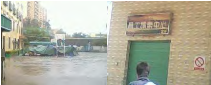
• Pic 5 Basketball court (left) and Recreation Center (right).

During the probation period, employees are not permitted to buy pension insurance. After the probation period has ended, if employees want to purchase insurance, they must fill out a written application, but only after they have paid for it in full. During the new employees training orientation, human resources staff tells workers, "You all are not from Guangdong province, buying this for such a short time is useless. Even if you buy it now, you cannot retire, so it is best not to buy it. But if you really want to buy it, wait until after the probation period is over and then apply."