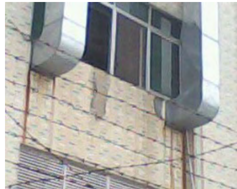
• Pic 12 Exterior view of the factory building.

The use of factory dormitory and canteen is optional, and the service is quite acceptable. The monthly lodging fee is about $4.4 (30 RMB) and the daily dining expense is about $0.88 (6 RMB) including lunch and dinner. Containing 4 bunk beds, a dormitory room can house eight people at most, but usually rooms are not filled. Each dormitory room has its own individual bathroom and hot water is available every night from 10 p.m. to 11:30 p.m. The factory canteen is on the first floor of the dormitory building. Workers each can get three dishes and one soup. All tableware is sterilized, which many employees feel happy about.