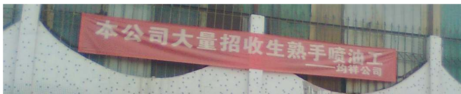
• Pic 11 Bar stating that, direct recruitment is in process, with lots of opening positions.

Workers do not go through a physical exam before employment. All employees will be provided with one-hour orientation training on factory policies, work safety, and so on. Workers are paid during the training period. Contract workers should wear the uniform provided by the factory for free, but the uniform should be returned when a worker leaves the factory.