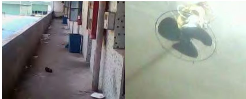
• Pic 9 The hallway of dormitory building.