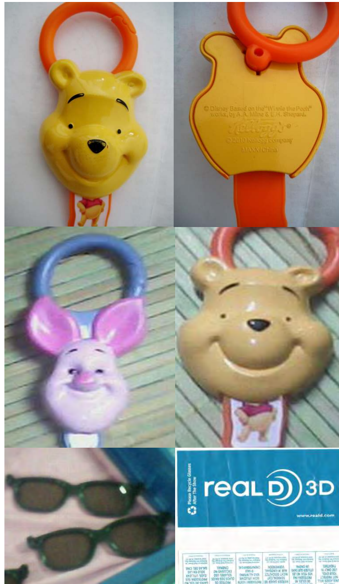
• Pic 1 Products of Hengtai.