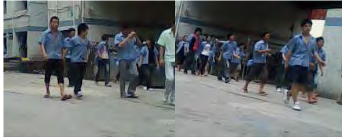
• Pic 3 Workers on-site on a Sunday

According to the employee manual and the wages article, employees' wages should be paid on the 22nd of each month. However, the factory actually pays wages on the last week of each month, on Tuesday or Friday afternoon. If, during the month, the factory suspends work, the wage payment date extends beyond the duration of the shutdown. The payment of wages clause in the employee manual and the actual time of payment of wages are inconsistent.