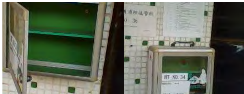
• Pic 4 Empty first aid kit.

These supposed entertainment facilities are only there for looks. The factory's employees are only able to engage in a few activities in the nearby area, including surfing the Internet in an underground Internet cafe, cross-stitching, or shopping.