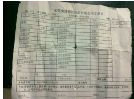
Worker's pay slip

Workers typically are paid 1,600 RMB/month after all monthly fees are deducted (utilities, food, fines, etc.). Each worker's base salary is 1,100 RMB/month, the minimum wage in Dongguan. Workers receive 9.48 RMB/hour for regular overtime and 12.64 RMB/hour for Saturday overtime.