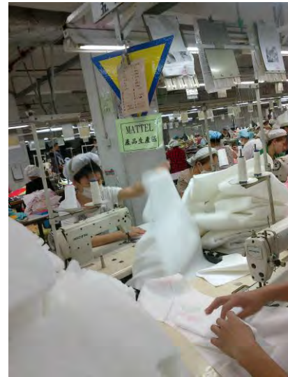
Mattel Sign in the Workshop

The labor contract states that on average, a worker's overtime hours will not exceed 36 per month. In reality, every worker works 2 hours of overtime each day and 8 hours of overtime on Saturday. Although this is clearly in contradiction with the factory's labor contract, none of the interviewed workers knew if this work hour system had ever been investigated by the labor department. There wasn't any sticker or file attesting to such an investigation anywhere in the factory. Workers may also receive exemption from working overtime hours with the approval of their workshop supervisor.