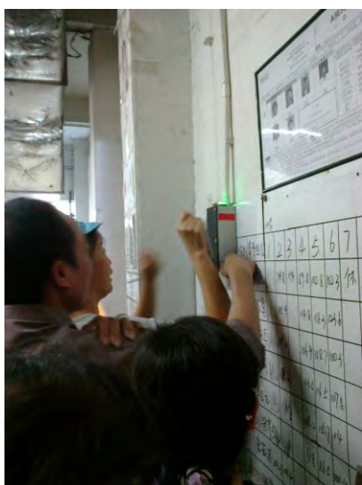
Swiping in to begin a shift

Workers must swipe their employee card at the front gate to enter and exit the factory. When entering the factory, workers must also hand their employee card to an inspector who will verify the registration number and make sure that each worker is using his own card. Workers must arrive at their respective workshops fifteen minutes before the beginning of the shift. Further, workers are not able to swipe out at the end of the shift until a minute or two after the shift time has passed.