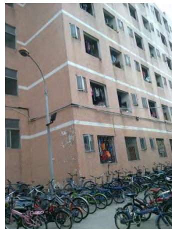
Outside the Dorms

The factory has a cafeteria that provides communal meals. Cafeteria food is subcontracted out to another company. The factory only provides lunch. For 5 Yuan ($.80 USD), employees receive three dishes and one soup. Workers simply need to swipe their employee card in the cafeteria and the 5 Yuan will be automatically deducted from their account. Workers expressed that the cafeteria food is poor; it is not cooked with oil and most of the meat is fat. Outside of the factory, one can purchase a boxed lunch that contains two meat and two vegetable dishes for the same price.